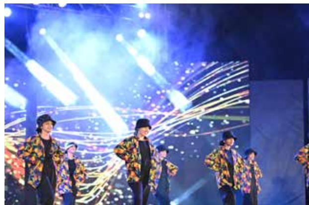
Annual Day Celebration