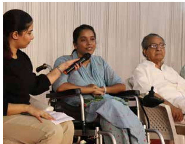
Lead IAS Coaching Inauguration