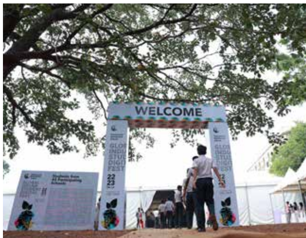
Global Indian Student Digital Fest