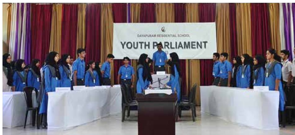
School Parliament Meeting