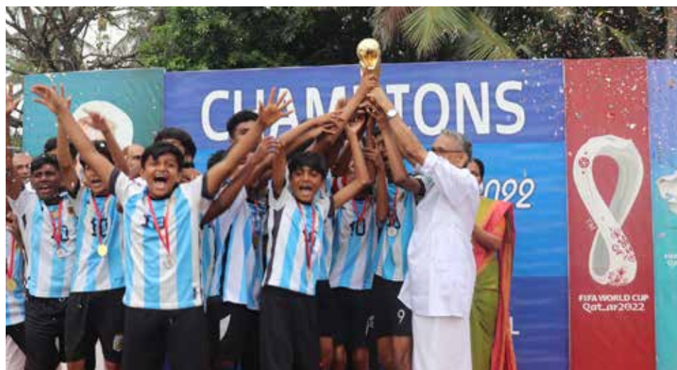
Dayapuram Mini World Cup